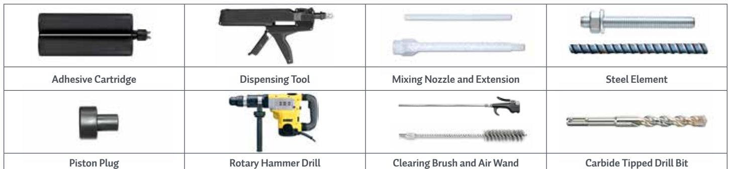
Table 1: Components of an Adhesive Anchor System

Adhesives used for anchoring typically take the form of either a two-part resin and hardener (e.g., epoxy) or a two-part resin and catalyst (e.g. acrylate) that can be packaged in cartridges, glass tubes, foil packages or delivered in semi-bulk containers. There are two primary types of anchoring adhesives: epoxy resin systems and radical-cured systems which include vinylesters, acrylates and polyester resins. When the two parts are mixed together in the correct proportion, they chemically react to form a durable polymer matrix which, when used with a threaded rod or reinforcing bar, can create a robust concrete anchor. In addition to the adhesive and steel anchor element, a complete adhesive anchor system will also include a variety of hole cleaning and installation tools as required in the manufacturer’s published installation instructions. Typical items are shown below.